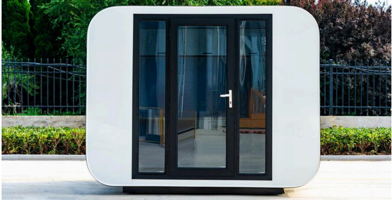
3M Micro pod – Empty $9,980.00

Compact and highly flexible — The 3M Micro Pod – Empty offers 6 m 2 of usable space (L 2.93 m × W 2.24 m × H 2.36 m) in a lightweight, portable structure, weighing around 870 kg. Designed for a variety of uses — from a backyard studio or office to a smart storage space or guest cubby — it comes pre-wired for electricity and features a push-out window and top spotlight. Durable, easy to transport and quick to set up — the perfect compact solution for flexible living or working.